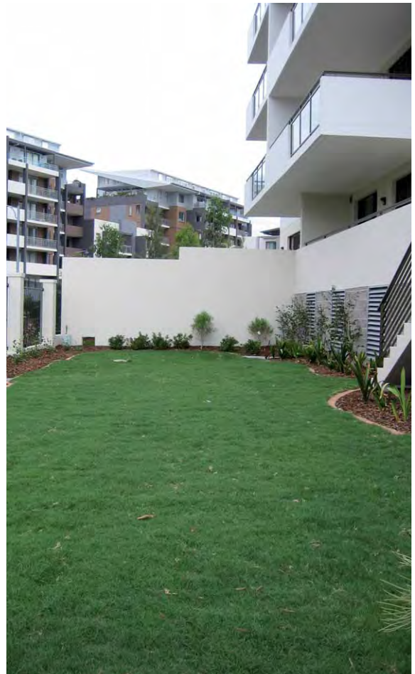
VersiTank® Retention System installed under a landscaped area allows water to be re-used