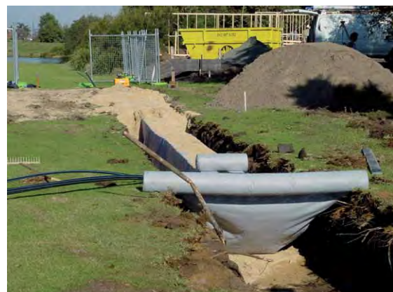
VersiTank® Infiltration System used in a trench application